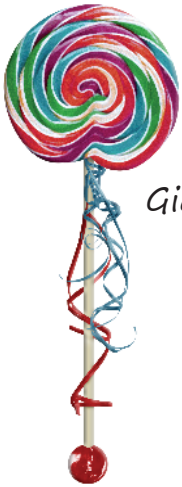
Giant Swirl Lollipop

Find each of the items on this sheet and place the proper sticker next to each one. Return your paper to claim your prize!